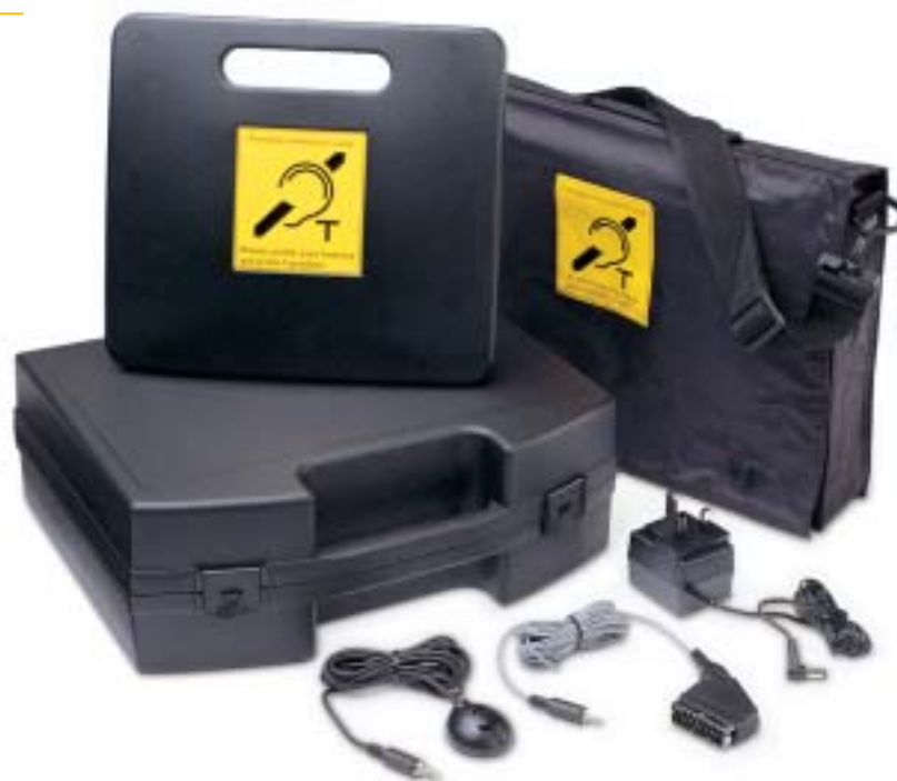
Portable InfoLoop™ with accessory options