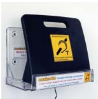
Wall-mounted charging unit